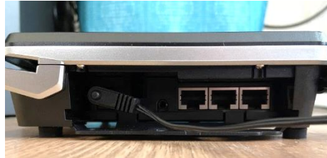
Real Image of MX915 (back)