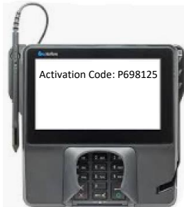
Terminal with activation code.

NOTE: Please provide the activation code to a Storage Commander Technical Support Representative for activation.