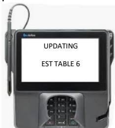
Terminal with updating notification