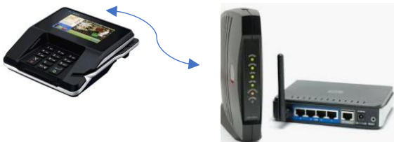
Terminal plugged into Modem OR Router