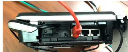
Real Image of MX915 (back)