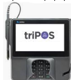
Terminal with TriPOS