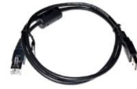
7" Ethernet Cord